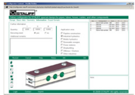
Request a quotation and download 2D or 3D CAD file.