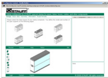
Select the basic design of your clamp assembly.

Online Configurator for Custom-Designed Clamps