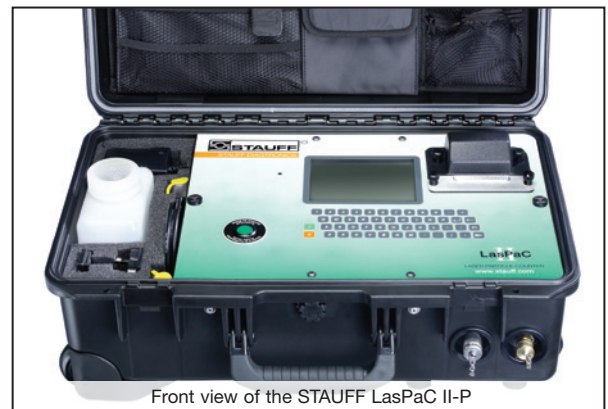
Front view of the STAUFF LasPaC II-P

The integrated printer in the LasPaC II-P supports printouts in the field, thus providing immediate documentation. Every printout confirms date and time of your measurement.