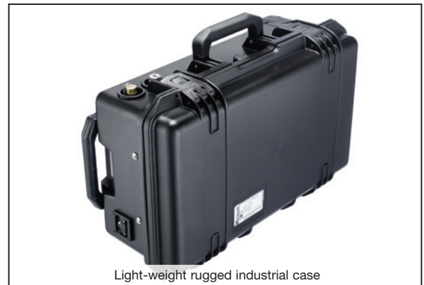
Light-weight rugged industrial case

The optimized flushing process of the LasPaC II-P is quick and effective, and allows for continuously accurate measurements.