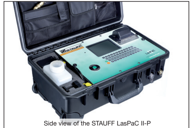
Side view of the STAUFF LasPaC II-P

With the LasPaC II-P you have the ability to measure, analyze, and document your results immediately without the need of any additional equipment.